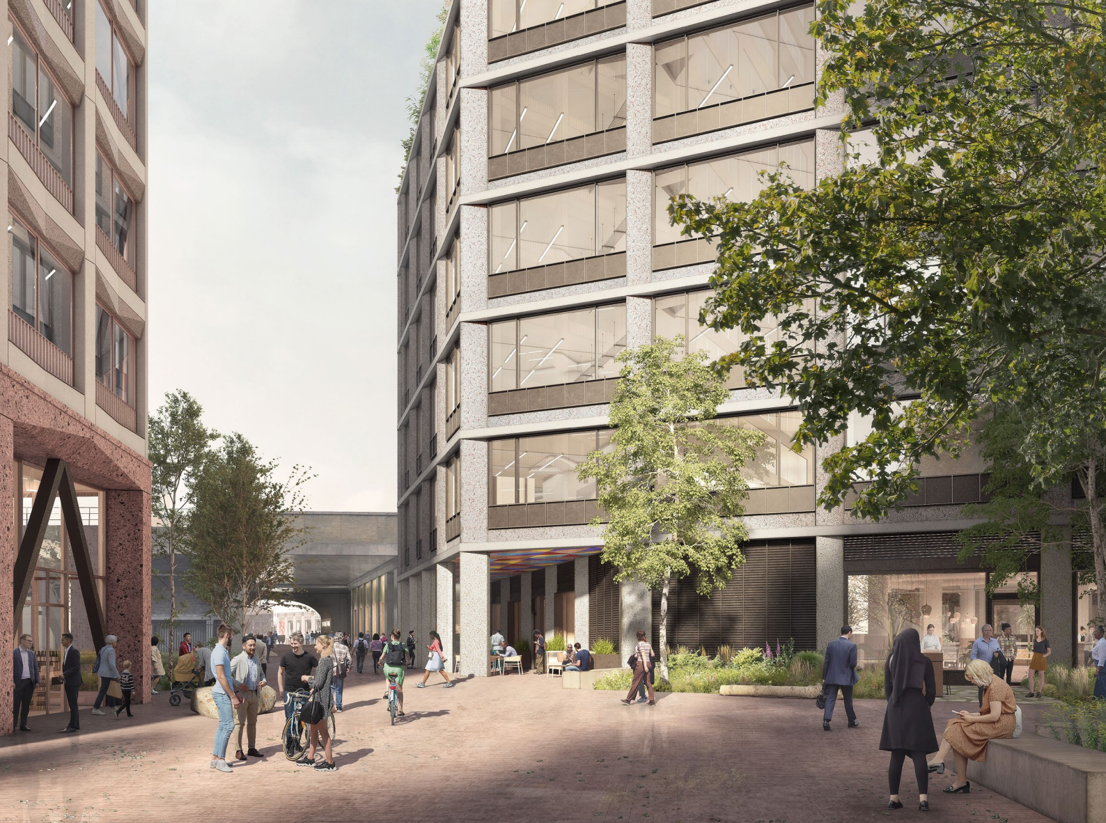
CGI showing Plots D and E of the Royal Street development