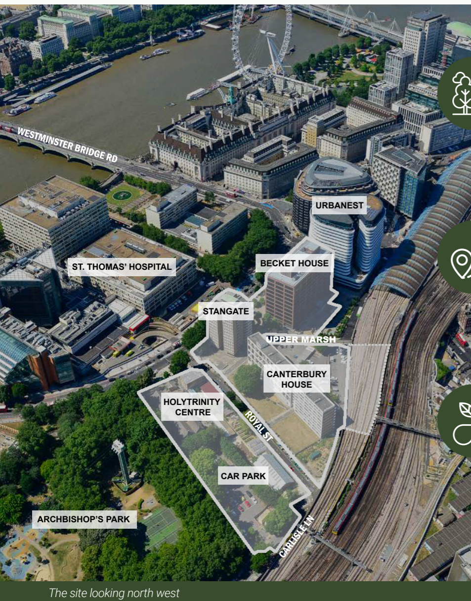
The site looking north west

Buildings designed with a focus on climate resilience including low carbon design features and significantly reduced embodied carbon.