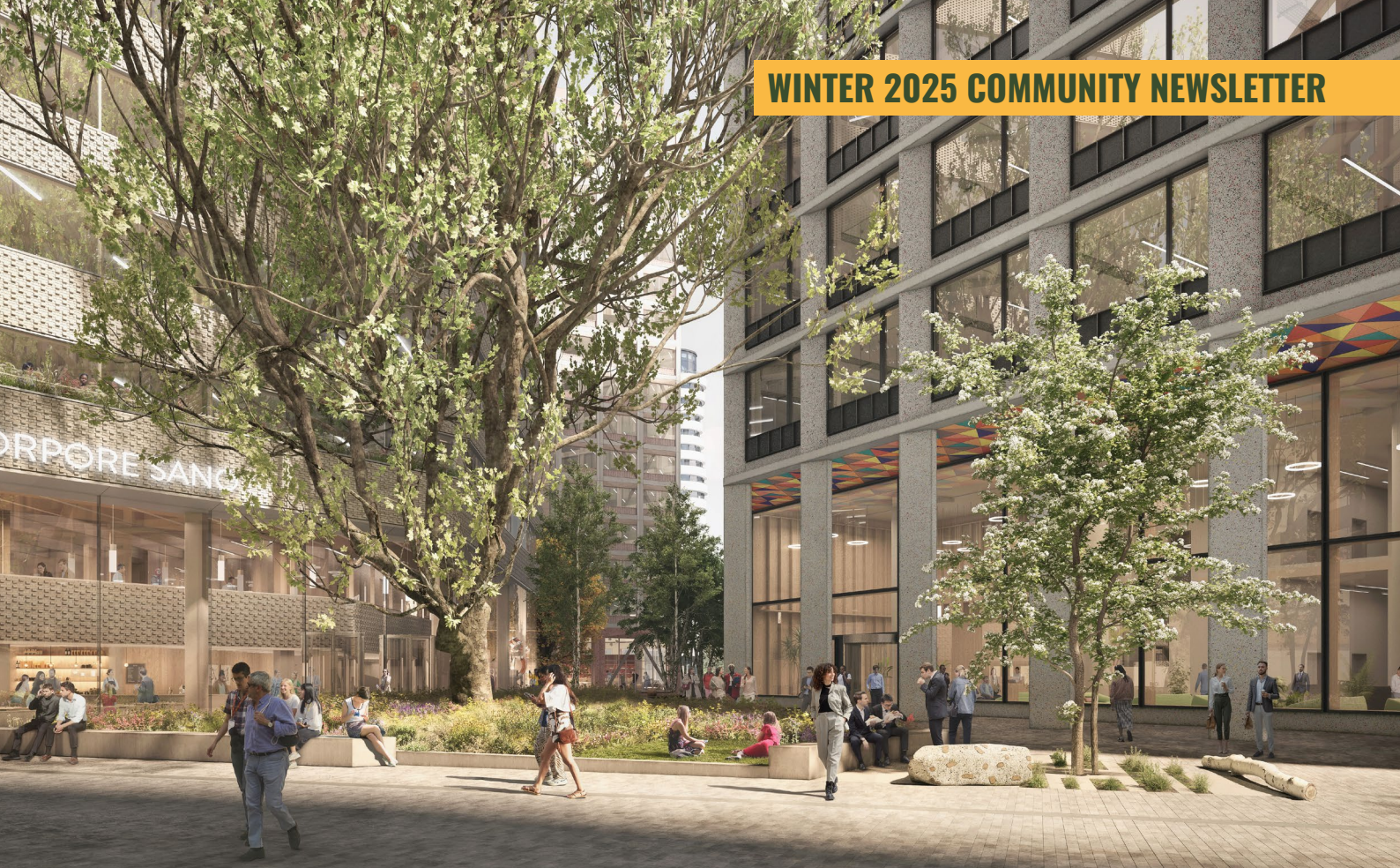
CGI showing Plots C and D of the Royal Street development